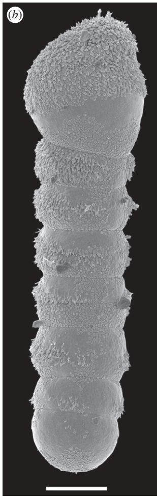
Figure 1. Two 'unexpected' examples of convergent evolution. (a) Trackways from the Santo Domingo Formation (Late Triassic-Early Jurassic) of Argentina that are interpreted as representing the activities of some sort of theropodian avialian ('bird'), and possibly convergent to other flying theropods. Centimetric scale bar. (b) A protistan convergence. The dinoflagellate Haplozoon praxillellae, an intestinal parasite of polychaete worms that has converged on a cestode-like bodyform, including attachment structures, strobilation and a hairy covering. Scale bar, 10 mm.

why animals seemingly effectively occupying certain ecological niches were somehow replaced by phyletically distinct forms sufficiently similar to be mistaken for one another'. So, it seems that something very like a dinosaur is very much on the evolutionary cards. From this perspective, the important insights on the question of competitive superiority of the dinosaurs as against the archosaurs (Brusatte et al. 2008) still need to be seen in the wider context of the